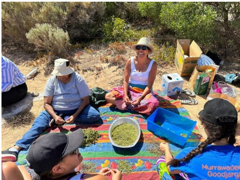
Image description: Four people sitting on a coloured piece of cloth on the desert ground focusing on a bowl of bush medicine leaves in the centre of the cloth.

Bangarra tells stories through dance. Before creating the dance, the creative team and the dancers go to the place where the story comes from. This is called going On Country. A great deal of time is spent walking on Country, listening to stories, sharing food, and learning about the history of the place.