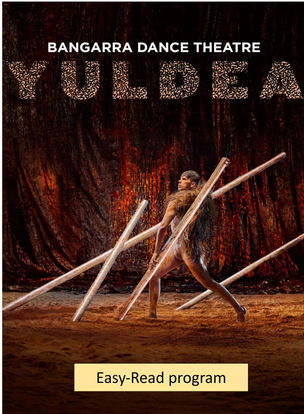
Image description: a male dancer stands in an open position facing the side, the right leg slightly bent, the other extended behind him. He is dressed in skin coloured under garments; his upper body covered in a fabric with emu feathers stitched to it. His body is painted with yellow and brown body paint. He stands amid four long poles that lean on a diagonal. The backdrop has a red and black sheen.