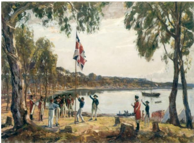
Image description: A group of military men are raising a British flag on the shore. The background shows bushland, a boat, and a bay of water.

Image description: An outline map showing the shape of the Australian continent. A pink arrow points to the location of Yuldea (or Ooldea) in the lower part of the continent.