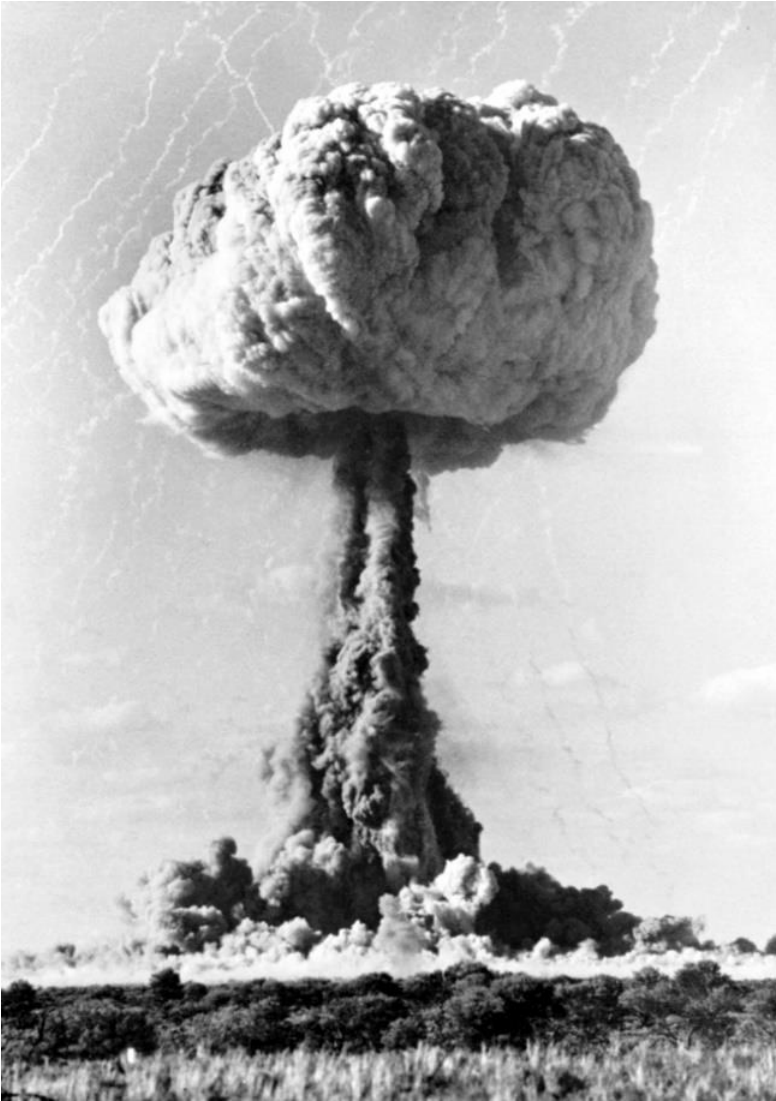
Image description: An atomic bomb explosion cloud of dust rises towards the sky and forms a mushroom shape at the top.

The other big impact on the Yuldea communities was the atomic testing that happened at a place called Maralinga. The Australian government allowed the British government to test their atomic bombs in the South Australian desert because they incorrectly decided it was uninhabited. But there actually were Aboriginal people living there. The government did not understand that Homelands are very important to Aboriginal people for their Cultural survival.