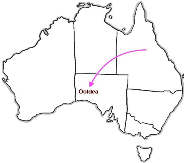
Image description: An outline map showing the shape of the Australian continent. A pink arrow points to the location of Yuldea (or Ooldea) in the lower part of the continent.