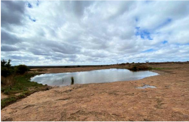
Image description: A large waterhole, several metres across, is seen in the desert against a background of blue sky and fluffy white clouds.

Yuldea is the site of an important waterhole. This waterhole is surrounded by small sand hills and is called Yoodil Kapi, which is its traditional Aboriginal name. Aboriginal people travelled long distances from the western desert, and from the Nullarbor plain to gather at the Yuldea waterhole. They would come to trade tools and food, to arrange marriages, and to have special ceremonies.