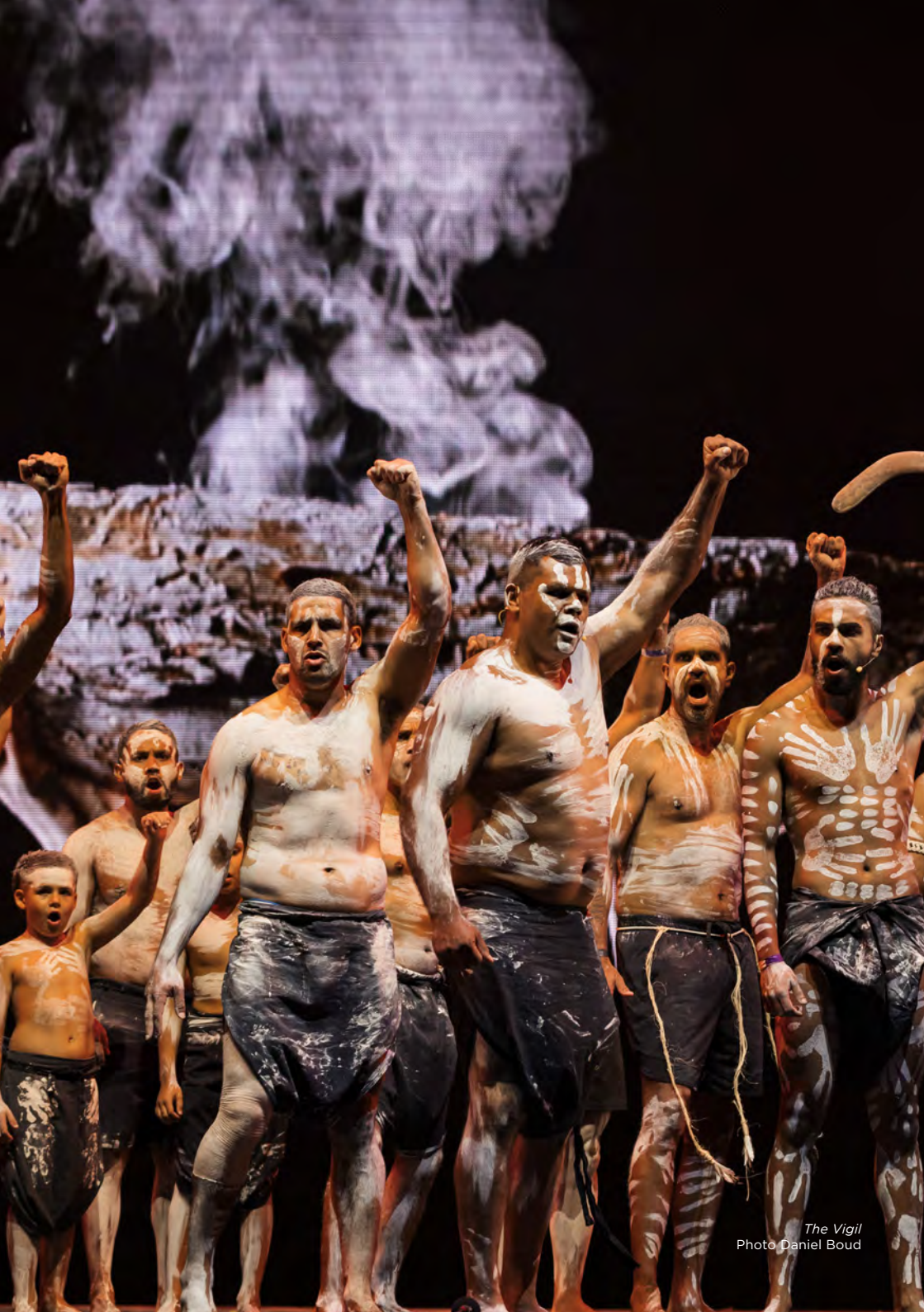
The Vigil