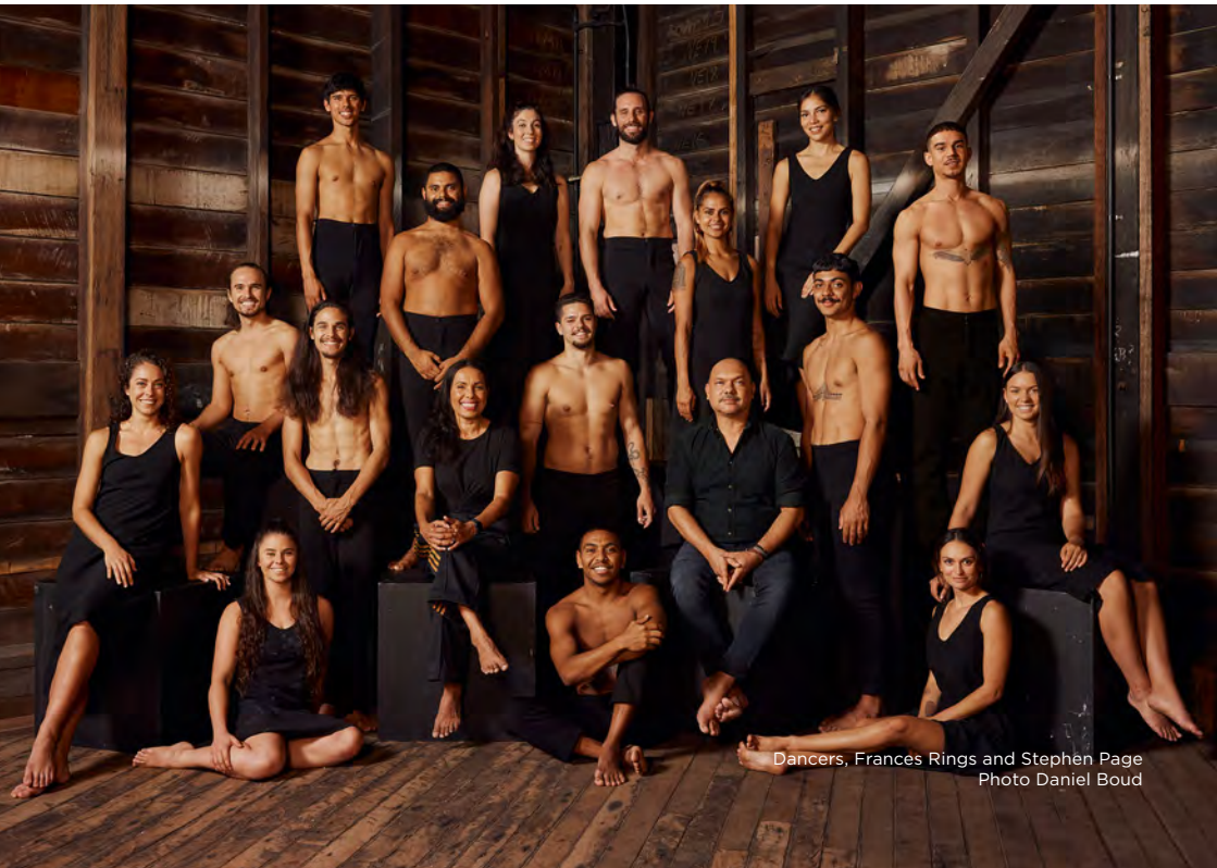
Dancers, Frances Rings and Stephen Page