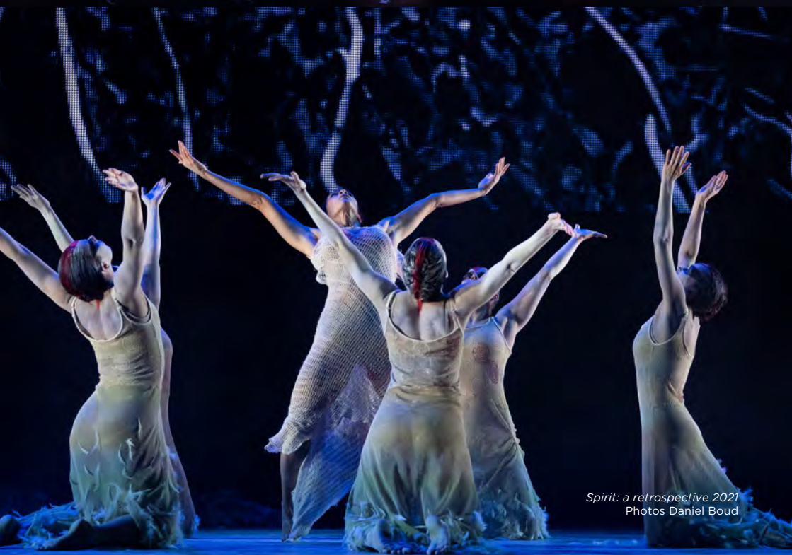
Spirit: a retrospective 2021