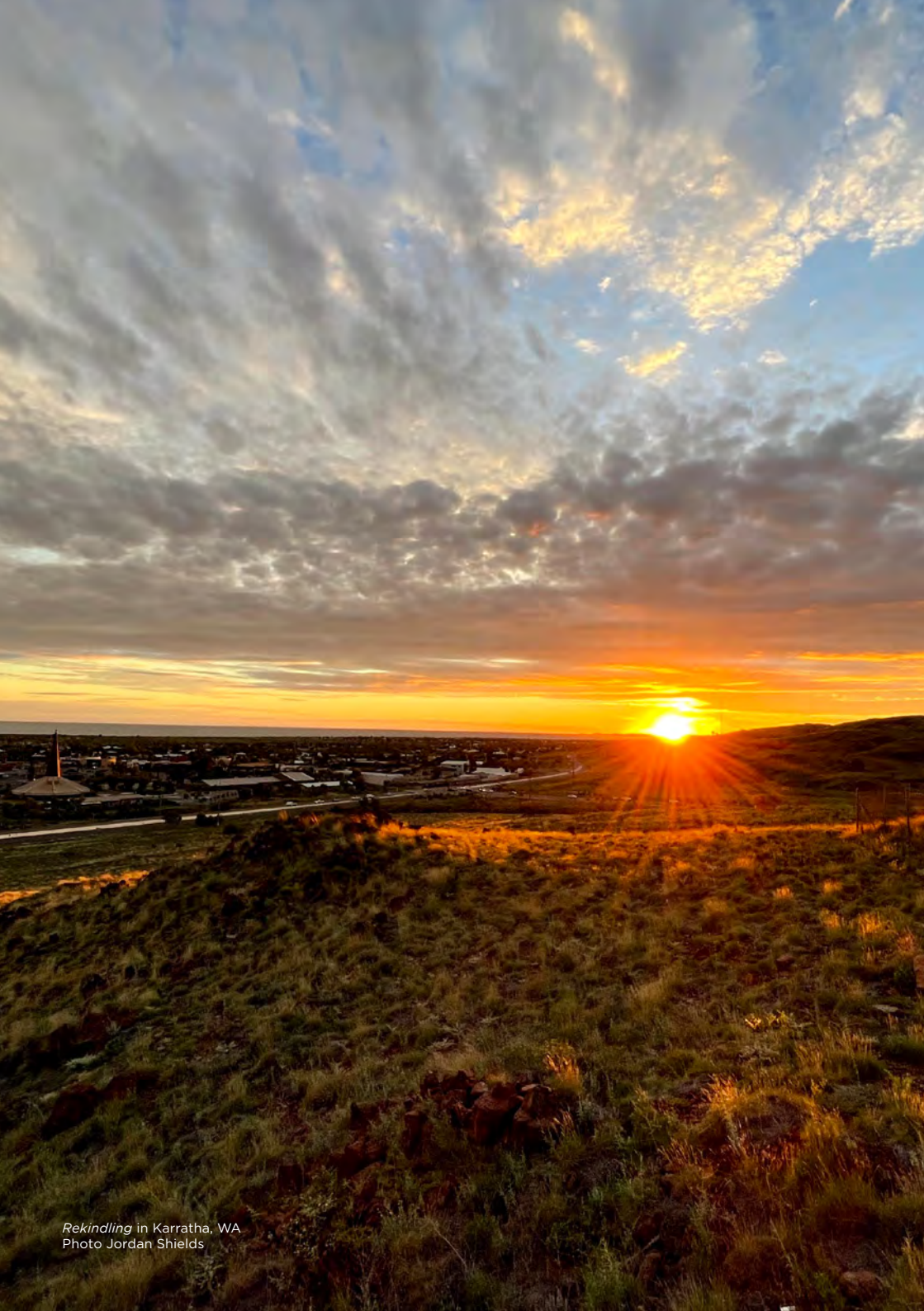
Rekindling in Karratha, WA