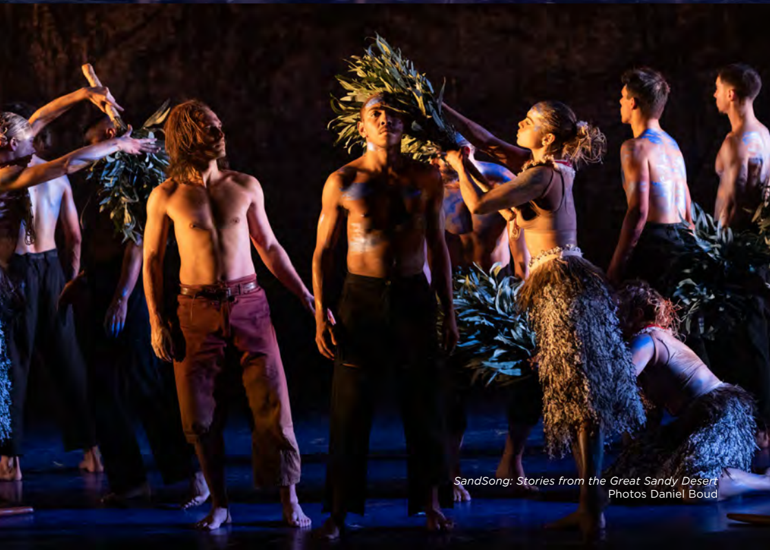
SandSong: Stories from the Great Sandy Desert