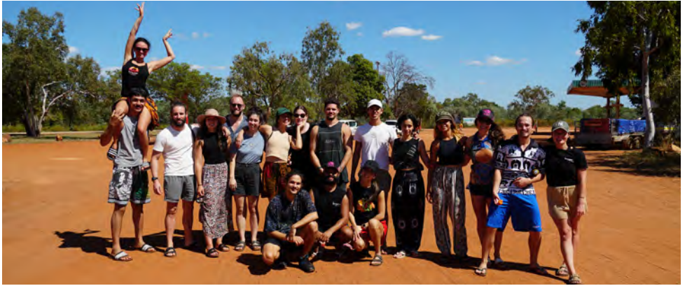
Dancers and production team On Country in Fitzroy Crossing