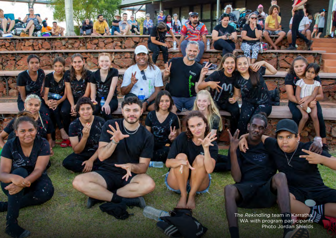
The Rekindling team in Karratha, WA with program participants